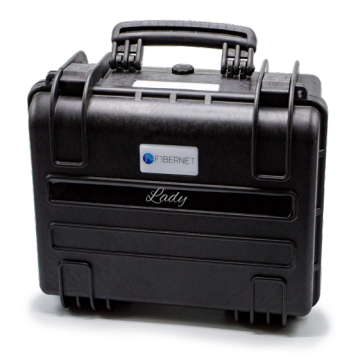
Rugged waterproof case (1 pc)