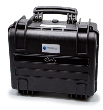
Rugged waterproof case (1 pc)